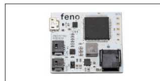
fia line hub lin