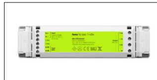
fd dali 1-48e