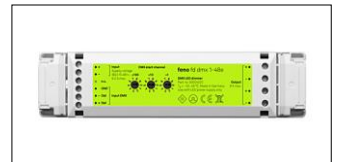
fd dmx 1-48e