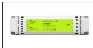
fd analog 1-48e