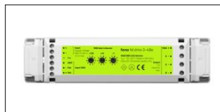
fd dmx 3-48e