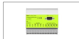
fc s.dmx 144d