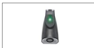
fc dmx 512u