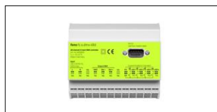
fc s.dmx 48d