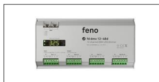
fd dmx 12-48d