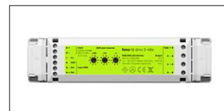
fd dmx 3-48e