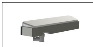
fe s.soft lt1-4 pro