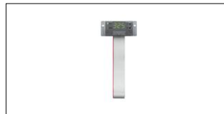
fi assist display-90