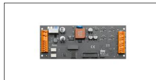
fi dmx-dali 4