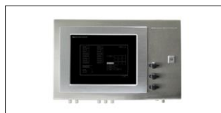
fc s.dmx lcs