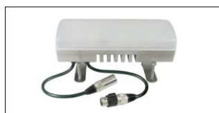
fe s.soft lt1 4