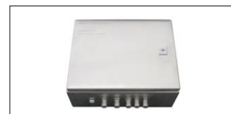
fi mains-dmx 2b