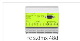
fc s.dmx 48d