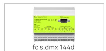
fc s.dmx 144d